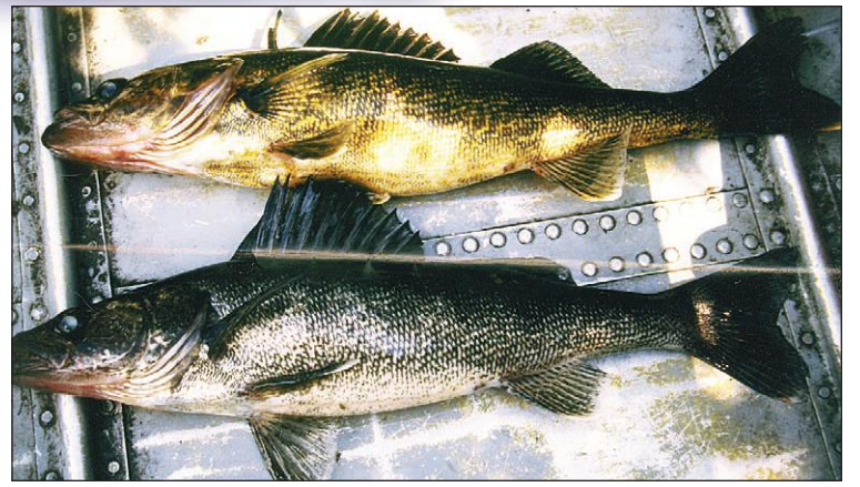
Dr. Wayne Schaefer has followed up on reports of strange-colored "blue walleyes" in northwestern Ontario. More information is available online at www.bluewalleye.com .

The DNA analysis showed the blue walleyes from Ontario were genetically similar to the normal-colored walleyes, and not the extinct blue pike. But many questions remain as to why the different color. Schaefer took a knife and lightly scraped the side of the one of the blue fish and he could see clearly that the blue pigment was actually in the mucous of the fish. Moreover, he and his students sampled normal walleyes that had small areas of blue pigment in their mucous, too. Could it be spreading?