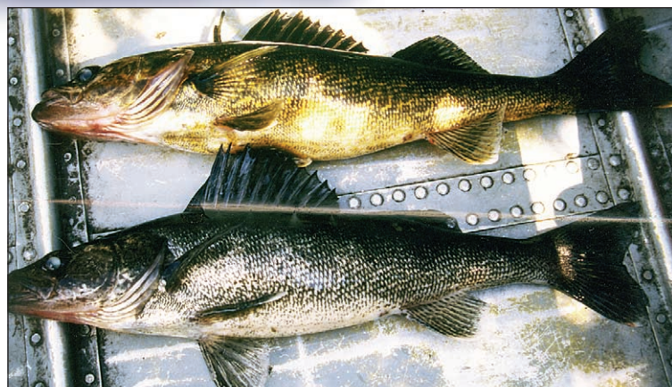
Dr. Wayne Schaefer has followed up on reports of strange-colored "blue walleyes" in northwestern Ontario. More information is available online at www.bluewalleye.com .

The DNA analysis showed the blue walleyes from Ontario were genetically similar to the normal-colored walleyes, and not the extinct blue pike. But many questions remain as to why the different color. Schaefer took a knife and lightly scraped the side of the one of the blue fish and he could see clearly that the blue pigment was actually in the mucous of the fish. Moreover, he and his students sampled normal walleyes that had small areas of blue pigment in their mucous, too. Could it be spreading?